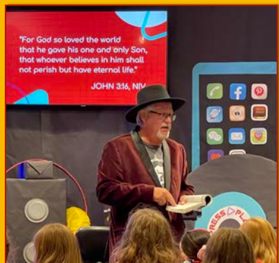
SHARING WITH CHILDREN THE TRUTHS OF GOD'S WORD