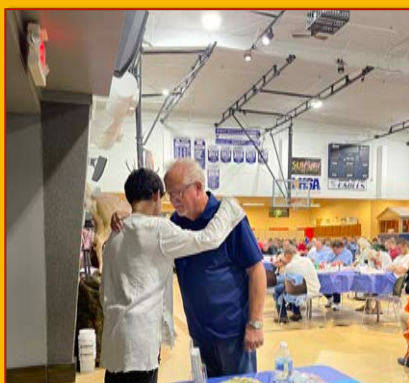
PRAYING FOR YOUNG MEN TO LIVE FOR JESUS

by being obedient to live that abundant JOYFUL life. That is my message and hearts desire. To share with a lost, dying, hurting world the BEST gift of all...our JOYFUL JESUS that waits to walk with us! Will you join me in carrying this message to so many who need it? I am ready to answer the JOYFUL call in 2022!