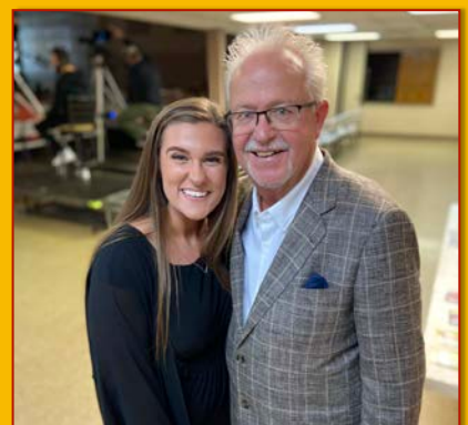
BRINGING JOY AND LAUGHTER TO THOSE IN MINISTRY