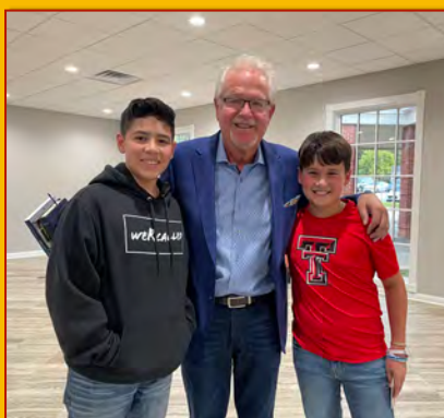
PRAYING FOR YOUNG MEN TO LIVE FOR JESUS

adults disillusioned by the world we live in. What is the answer to so many hurts and longings that we experience everyday? It is this HOPE! That is my message and hearts desire. To share with a lost, dying, hurting world the BEST gift of all...our HOPE, our JOYFUL JESUS that waits to walk with us! Will you join me in carrying this message to so many who need it? HOPE for all in 2023! I am ready to answer this HOPEFUL and JOYFUL call!