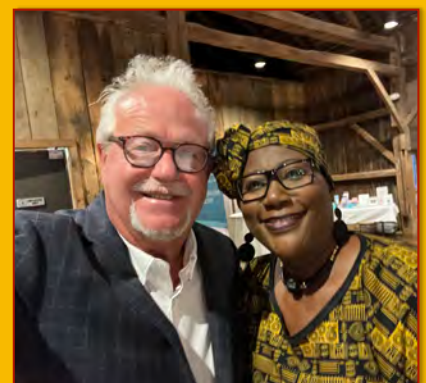
BRINGING JOY AND LAUGHTER TO THOSE IN MINISTRY