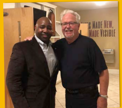
ENCOURAGING OUR CHRISTIAN MEN AND LEADERS