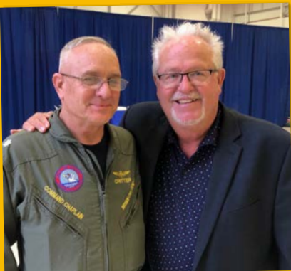
SERVING OUR MILITARY BASES AND CHAPLAINS

JOYFUL life. That is my message and hearts desire. To share with a lost, dying, hurting world the BEST gift of all...our JOYFUL JESUS that waits to walk with us! Will you join me in carrying this message to so many who need it? I cannot wait to continue to share the GOD GOODNESS in 2020!